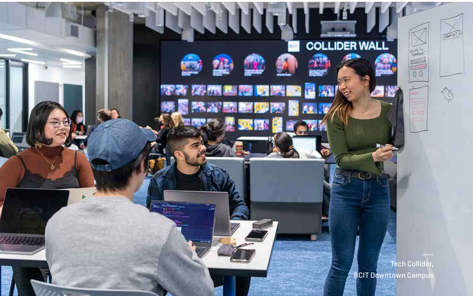
Tech Collider, BCIT Downtown Campus

Visit bcit.ca/studyabroad to learn more.