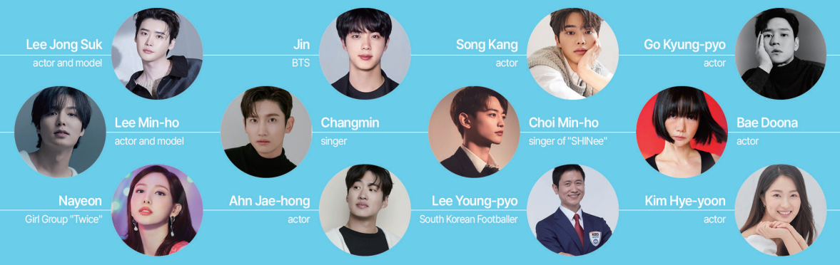
Alumnis of KU-Leaders of K-Wave

Tel +82.2.2049.6212, 6210 Email abroad@konkuk.ac.kr http://summer.konkuk.ac.kr http://www.konkuk.ac.kr/eng