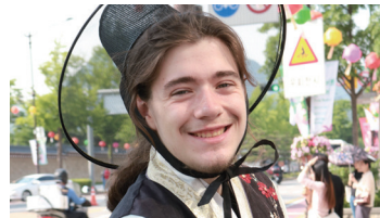
Jack from the U.S.